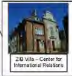
ZIB Villa - Center for International Relations