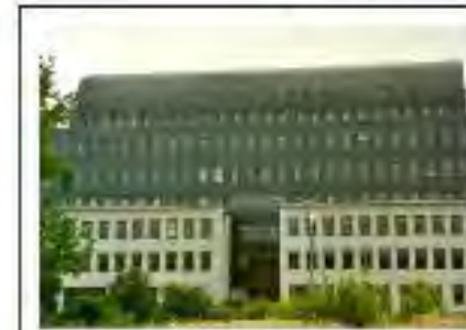
Amin-Szilviny - House Muthgasse 18