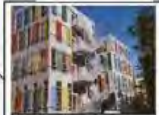
Schwackhöfer - House