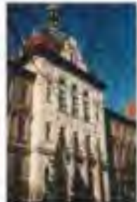
Mendel - House (Main Building - Dean's Office)

OH-Building Peter Jordanstr. 76 1190 Wien