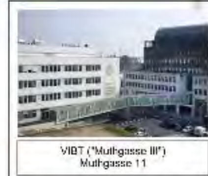
VIBT („Muthgasse III“) Muthgasse 11