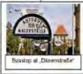
Busstop at „Dänenstraße“

Cafeteria („Mensa“) Baracke 1 Brokowskigasse 1 1190 Wien