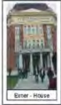
Erner - House